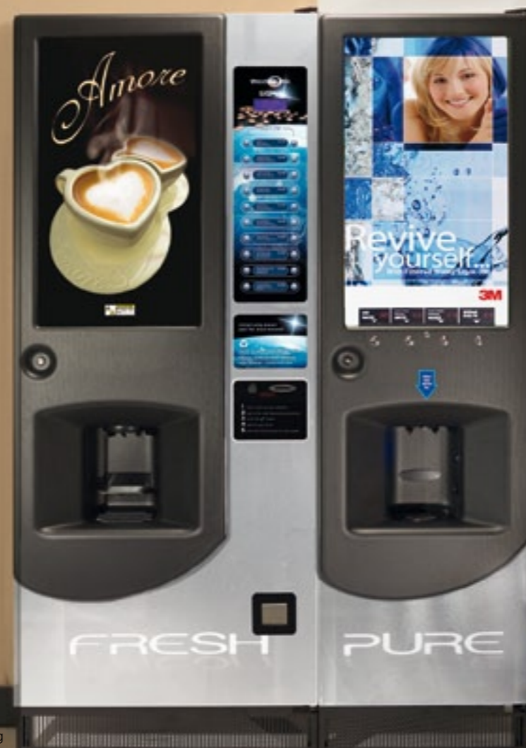
Shown with optional platinum branding

Go 12oz, touch-sensitive and eco-friendly with the Sigma beverage machine; bringing the coffee-house in-house!